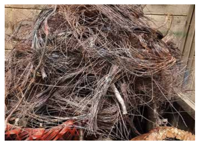
Typical copper scrap after motor burn out at EECO

Once the decision is made to repair a motor, its core is tested to validate that the magnetic properties of the core will support a copper rewind before it can proceed to the next step, which is the motor burnout in a temperature-calibrated oven in order to prevent any damage to the iron core. Following the burnout and the subsequent removal of the old insulation and copper, the core is reinsulated, rewound with new copper and vacuum impregnated with resin to protect it from chemical and moisture contamination.