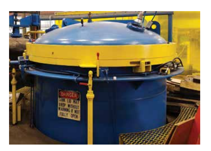
8-ft. Vacuum Pressure Impregnation (VPI) System at EECO's Industrial Motor Services in Richmond, VA

EECO's Industrial Motor Services specializes in the forest products industry, where heavy load demands put a lot of stress on the larger motors. Johnson continued, "The Richmond and Augusta locations rewind the larger motors. With 8-feet VPI (vacuum pressure impregnation) systems at each of those two facilities, we have repaired motors up to 3000 horsepower. When the Raleigh winding facility has the larger jobs, we have them vacuum pressure impregnated at one of the other two locations."