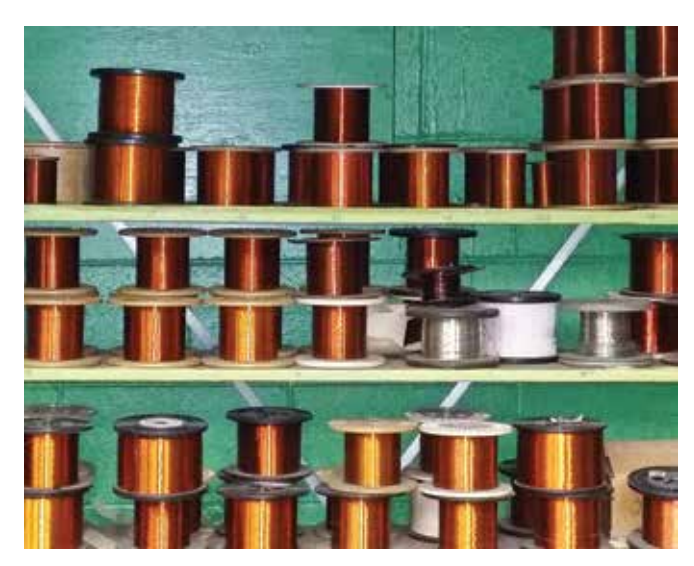
Rolls of new copper wire used in motor rewinds at FLOLO

"With three winding facilities we use a lot of copper; 75,000 pounds or 34.5 tons of new copper and we reclaim about the same amount in scrap annually," said Johnson.