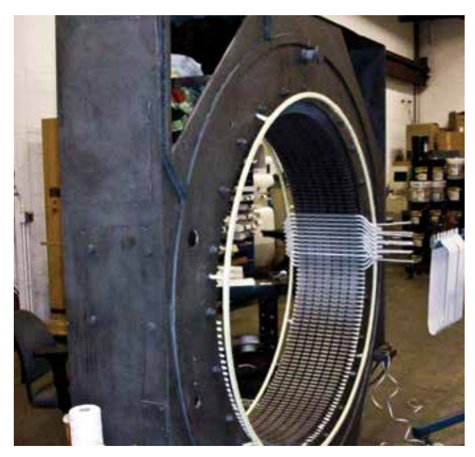
500 Horsepower motor undergoing new copper coil insertion

In addition to the mechanical improvements, manufacturers have made significant upgrades in the design of Premium Efficient® motors. By adding more copper in the windings – higher grade iron in the core and better insulation – they have increased the energy efficiency of these motors. One manufacturer, Siemens, has a Copper Rotor Motor with improved efficiency above the Department of Energy's (DOE) Premium Efficient® label.