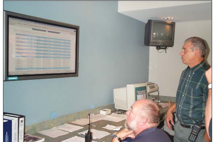
Figure 2. The operations center at Emory's Facility Management Division receives real-time performance data from ChillerCheck software, which collects data from sensors in Emory's 41 chillers. The software calculates operating efficiency for each chiller, compares results with nameplate efficiency and flags potential trouble spots on a display screen (photo) when efficiency drops by more than 5%. Operators can optimize a chiller selection based on this information and can schedule maintenance and repair when needed. The software also monitors the power drawn by HVAC system motors, alerting operators to potential electrical problems.

and outlet temperatures and flow rates, refrigerant temperature and pressure, bearing performance and other factors, along with power consumption (volts and amperes for each phase on drive motors). The software calculates real-time efficiency for each chiller and compares it with guaranteed nameplate values. It then reports each unit's efficiency loss, if any, to the system operator at a central control station and to Kicak's office PC as well as his PDA ( Figure 2 ).