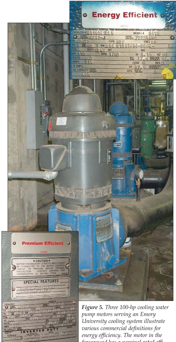
Figure 5. Three 100-hp cooling water pump motors serving an Emory University cooling system illustrate various commercial definitions for energy efficiency. The motor in the foreground has a nominal rated efficiency of 95.0% and carries a "Premium Efficient" label. 100-hp motors that qualify for the NEMA Premium rating have a nominal energy efficiency rating of 95.4%. Neither EAct nor NEMA Premium requirements apply to vertical, inverter-duty motors such as the one pictured here. The blue motor (center) carries an "Energy Efficient" label and is rated at 94.1%. The average efficiency of older, standard-efficiency motors such as the green unit shown at the rear of the photo is 92.3%. To ensure a true "premium efficiency" motor, look for a NEMA Premium label, or compare the nameplate efficiency data to the NEMA Premium requirements.

Sam McCullough is the service center's owner and chief technical specialist. McCullough has seen motor replacement